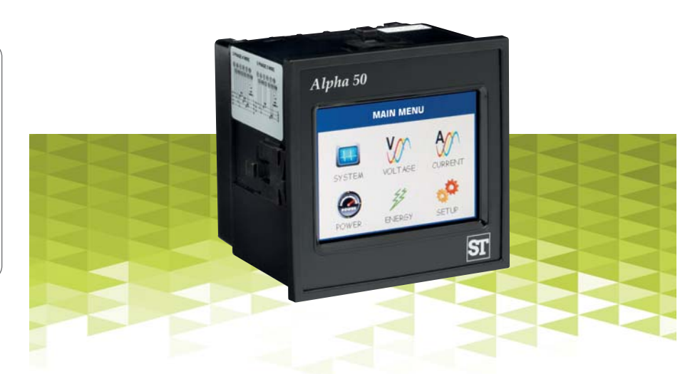
Alpha 50 is a compact multifunction instrument with touch screen LCD utility which measures parameters in 3 phase and single phase Network & replaces the multiple analog panel meters.